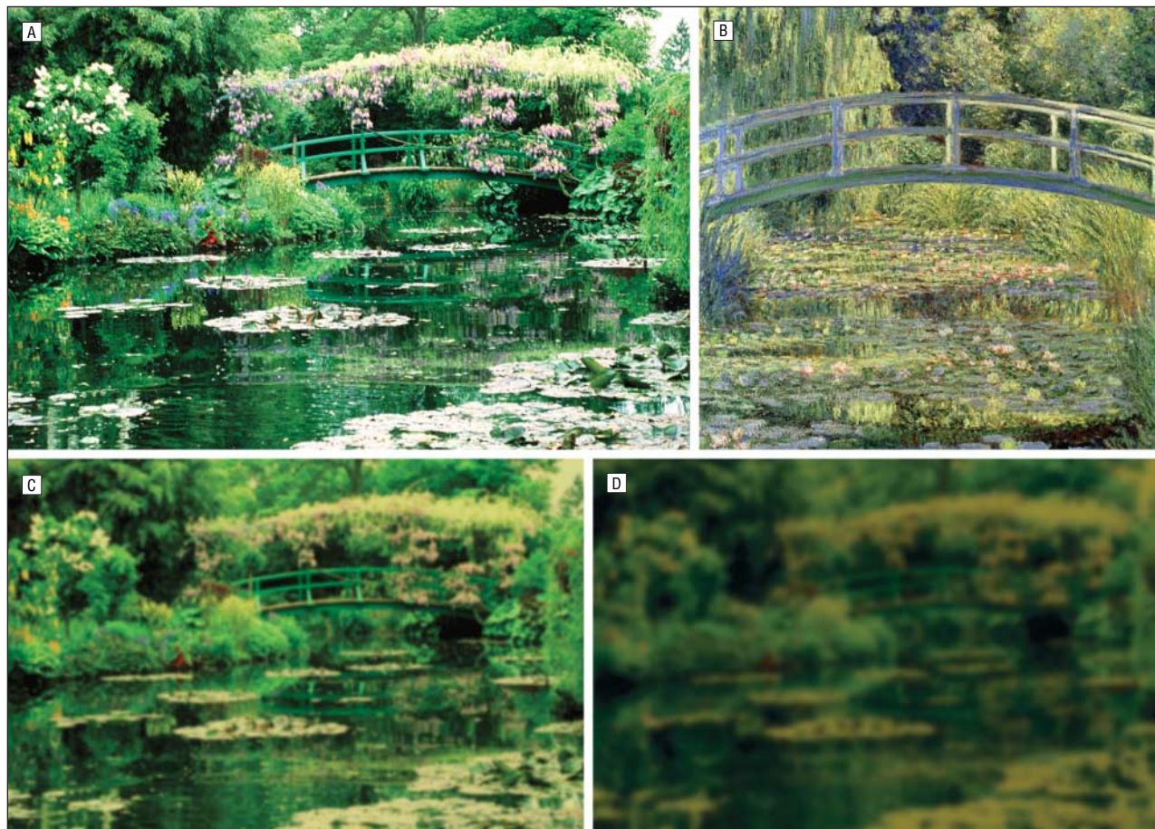
Figure 3. Monet's lily pond and the Japanese bridge at Giverny, France. A, Photograph of the bridge as it appears today (courtesy of photographer Elizabeth Murray). B, Monet's Water Lily Pond , a painting of the pond and bridge before any visual symptoms (1899; oil on canvas, 89 × 92 cm); National Gallery, London, England/Bridgeman Art Library. C, The same photograph of the bridge, blurred as it might appear through a moderate nuclear sclerotic cataract. D, The same photograph of the bridge as seen through a disabling cataract with a visual acuity of 20/200.

Degas' correspondence indicated that he was consciously trying to be more expressionistic or abstract; in fact, his pastels were drawn on larger and larger expanses of paper as he struggled to work. One critic wrote that "these sketches are the tragic witnesses of this battle of the artist against his infirmity." 14 One may reasonably ask whether Degas intended these images to appear to us the way they do and why he continued to work when the product seemed so out of line with his traditional style. Some answers may lie in the recognition of how these works appeared to him.