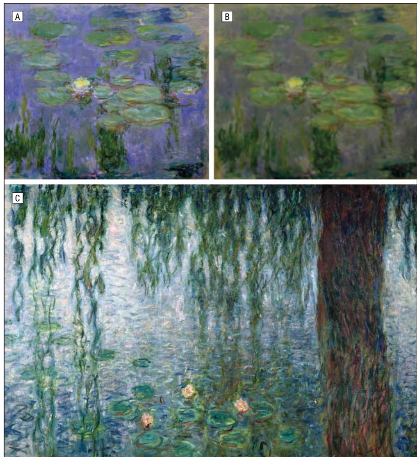
Figure 4. Water lily pond. A, Monet's painting Waterlilies done with moderate cataract (1915; oil on canvas, 130 × 153 cm); Musée Marmottan, Paris, France/. B, The same image blurred as it would have appeared to Monet through the cataract. C, Monet's painting Morning With Weeping Willows, detail of left section, done after the cataract was removed (1915-1926; oil on canvas, 200 × 425 cm); Musée de l'Orangerie, Paris/.

I must digress at this point to note that artists can respond in several different ways to a yellow filter (cataract) in front of their world, and one cannot predict necessarily how it will influence their art. Because cataracts are chronic, a patient may not be aware that the world looks yellowish (as there are no normal colors with which to compare). However, whether an artist recognizes the yellow bias or not, there will be a choice between painting a yellowish world or adding extra blue as compensation (eg, to make the sky