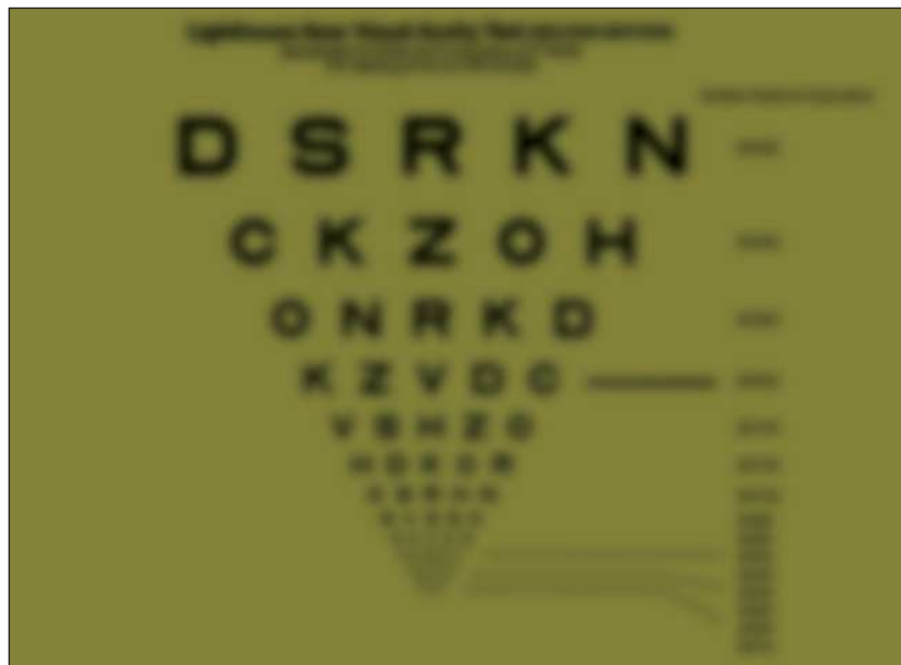
Figure 1. Visual acuity chart showing the blurring and color effects of a disabling brunescant cataract with a visual acuity of 20/200.